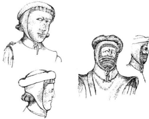
Fig.1 Examples of Padded Rolls (Blair 1972, p34)

There are two possible origins for the orle. The first is as a purely decorative ornament for a helm while the other possibility is as a development of the padded roll worn on the head or over a mail coif, as padding or an aid to stabilisation, and onto which a helm is placed (see fig.1).