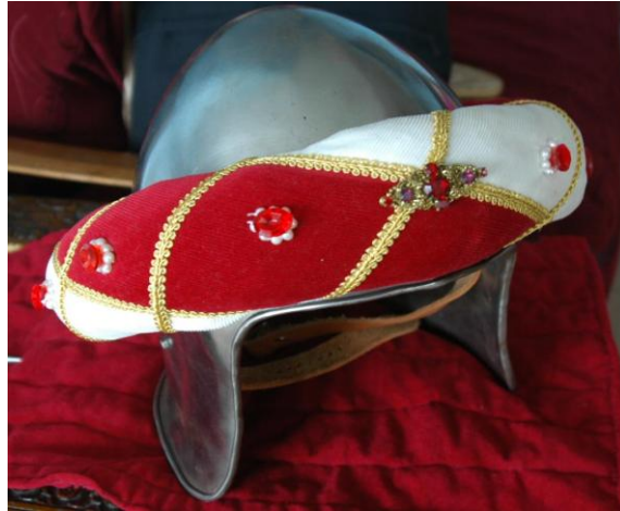
Fig. 9. Authors recreation of an orle.

A recreation of an orle by the author is shown below (fig.9). The materials used are red and white velveteens, premade gold trim, freshwater pearls, “ruby” jewel buttons and a costume jewellery brooch (a lucky ebay find). On further examination the recreation is approximately twice to 1/3 wider then it should be, depending on which example is used as a source. The recreation is also certainly far less elaborately decorated then the examples shown above.