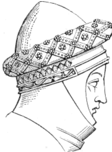
Fig.2 The monument of Sir H.Stafford from Bromsgrove, Kent (Boutell p219)

The funeral effigy of Sir Edmund Thorpe 1418AD (fig 3 & 4), shows the level of ornamentation and attention to detail that a symbol of wealth and status would require in the early 15 th century.