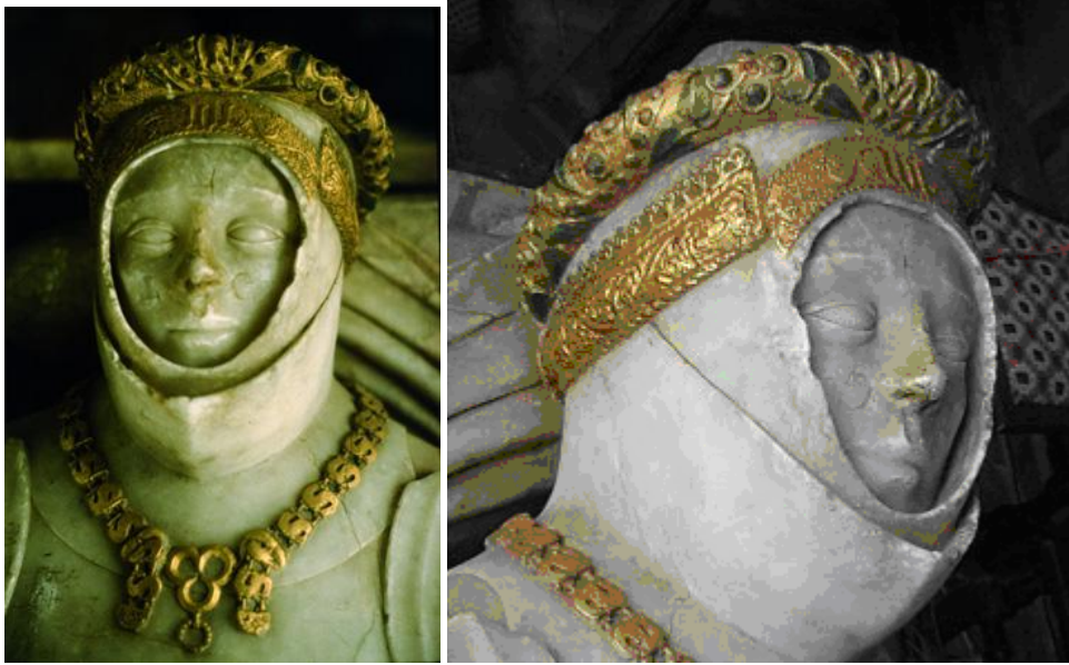
Fig. 5 & 6. The effigy of Lord Bardolph 1441 AD http://www.holycross.edu/departments/visarts/projects/kempe/model/7c.html