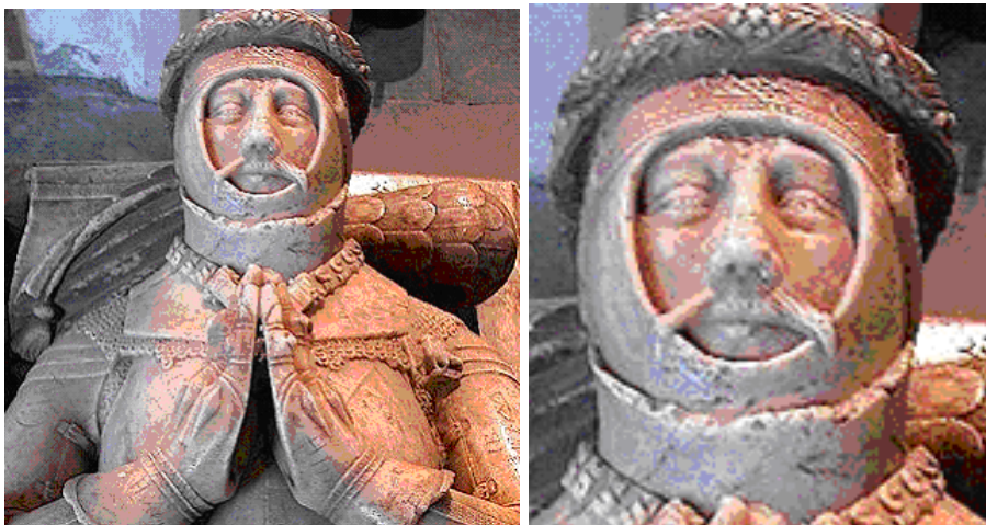
Fig.3 and 4 Edmund de Thorpe 1418

The funeral effigy of Sir Edmund Thorpe 1418AD (fig 3 & 4), shows the level of ornamentation and attention to detail that a symbol of wealth and status would require in the early 15 th century.